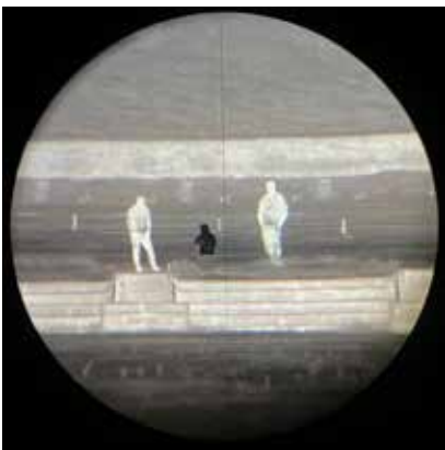
DRAGON thermal image of two soldiers (white/hot) stand next to a thermal target (black).

– SSGT Noema Taero – Small Arms Instructor, Combat School