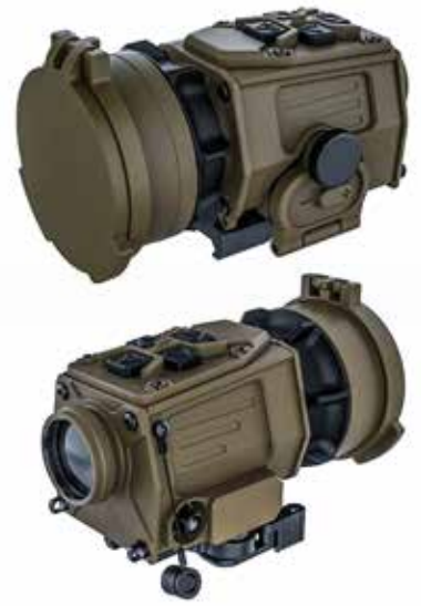
The DRAGON C12-XR from Qioptiq Ltd. (UK)