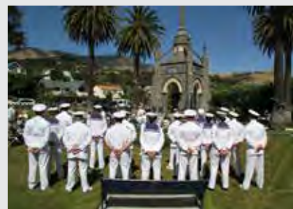
The handheld image shows the Memorial opening in 1924, with sailors from HMS CHATHAM.

The community's Anzac Day collection goes towards its maintenance, and close to $1m was raised to repair and strengthen the memorial following the Canterbury earthquakes.